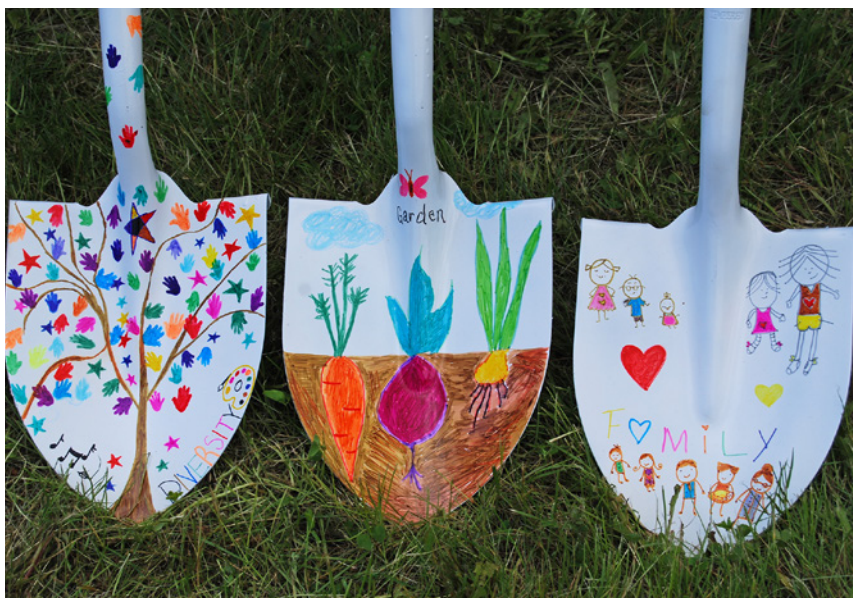
Shovels decorated by SOS Illinois youth, later gifted to special guests