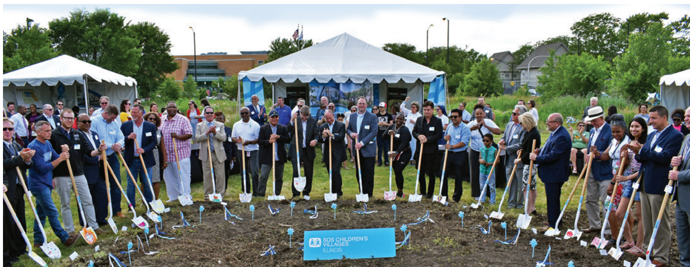
Roosevelt Square Community Center funders, area civic leaders, SOS Illinois staff, and Board Members ceremoniously break ground